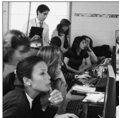
District-wide professional development for eSpark program.